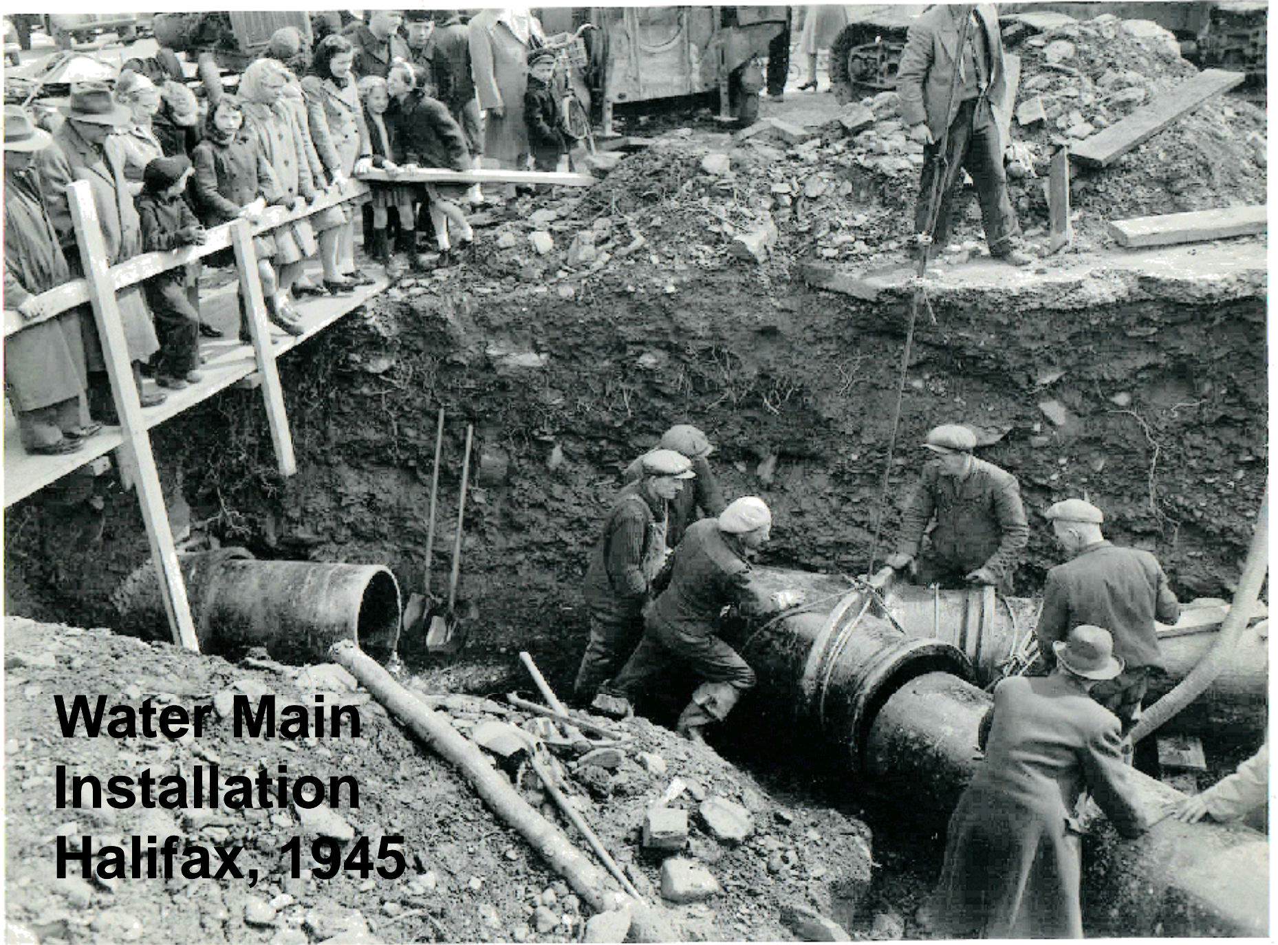
Water Main Installation Halifax, 1945.